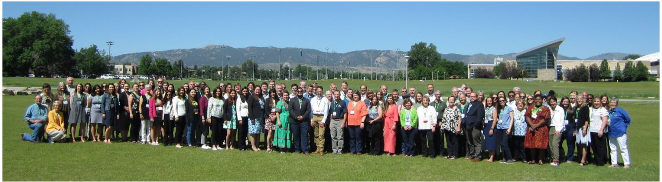
Attendees at the 2022 Annual Conference in Ft. Collins, Colorado

Join today at <a href="https://isash.org/">https://isash.org/</a>