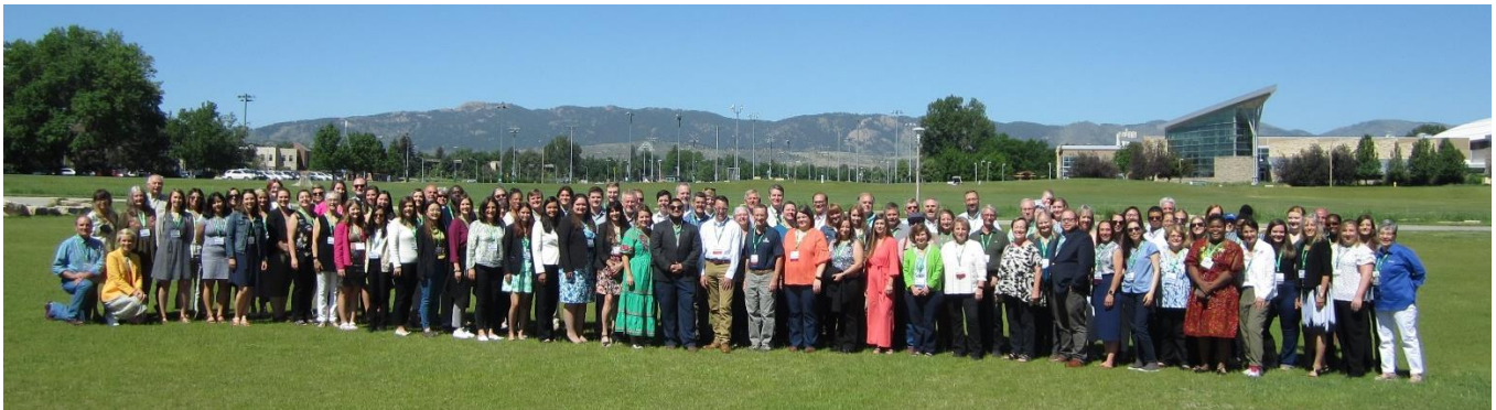
Attendees at the 2022 Annual Conference in Ft. Collins, Colorado